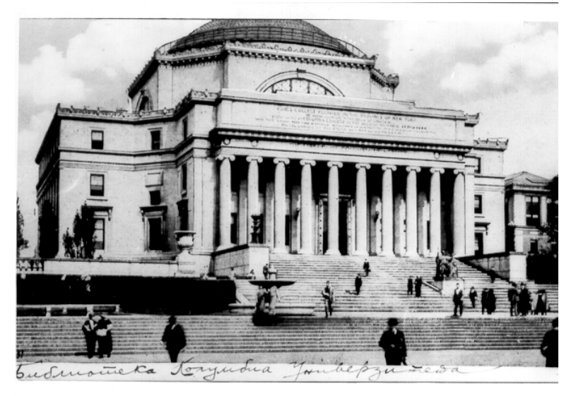
Columbia University - Library

Only two months following the discovery of X-rays, Pupin made successful photographs and applying a combination of phosphorescent screen and ordinary film he shortened exposure time inventing technique that is used today. After only three months of investigations, he succeeded in arriving at several original discoveries, which on April 6, 1896, were communicated to the New York Academy of Sciences. Among this was discovery that the primary X-rays produce the secondary X-rays upon reflection from different materials.