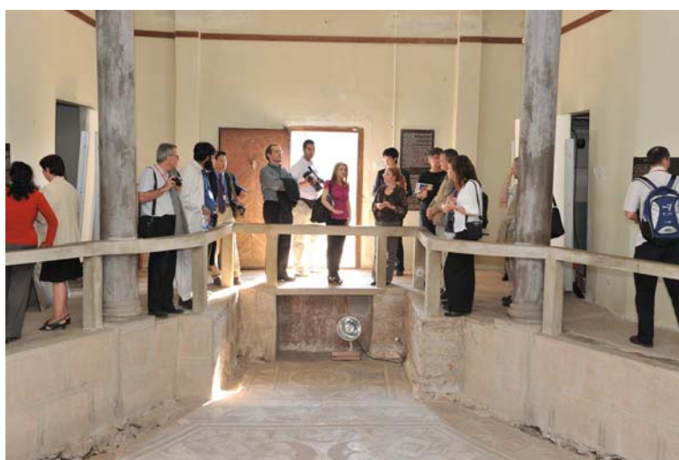
Sightseeing – Archeological place from Roman time - Mediana

The TELSIS Conference has as usual an entertaining social program. There was a reception for a group of authors organized by Major of the City of Niš and held in the City Hall in the first conference evening, followed by a nice musical performance for all conference participants in organization of the Student Cultural Centre of Niš. A mid-day break between morning and afternoon presentations on the second day, gave more time for all interested participants to visit the most important archaeological and historical places from Roman and Turkish time, as well as some parts of the city. The conference gala dinner was organized at the end of the second Conference day. Serbian national cuisine, an orchestra performing Serbian and international music, and, most importantly, cheerful guests made the evening memorable. Very warm and friendly atmosphere during the conference official work and social program contributed to informal exchange of ideas, new friendships, and new connections between different countries and universities.