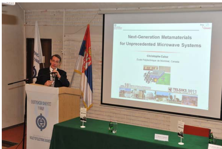
Prof. Christophe Caloz at TELSIS 2011

This year's conference has sparked great interest. All submitted scientific and application-based manuscripts were evaluated by at least two reviewers from International Review Board. Conference Program Committee summarized all Review Reports and made final decision about the status of the paper. Total number of the papers selected for presentation was 162, 19 of which were invited papers presented at the beginning of related sessions. Authors of the papers are scientists from the following countries: Australia, Belgium, Bosnia and Herzegovina, Bulgaria, United Kingdom, Greece, Denmark, India, Iran, Italy, Israel, Japan, Rep. of Korea, Canada, China, Hungary, Macedonia, Germany, Romania, Russia, Slovenia, Serbia, South Africa, Taiwan, Turkey, Croatia, Czech Republic, Spain, Switzerland, Sweden, France, Finland, UAE, USA. During this three-day conference, 14 regular sessions and 8 poster sessions were organized.