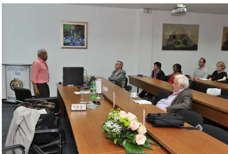
Prof. K.R. Rao at Session "Image Processing"

As the previous TELSIS conferences, this year's conference was not just a scientific event, but also an event which included many activities and meetings covering different important topics in the field of telecommunications.