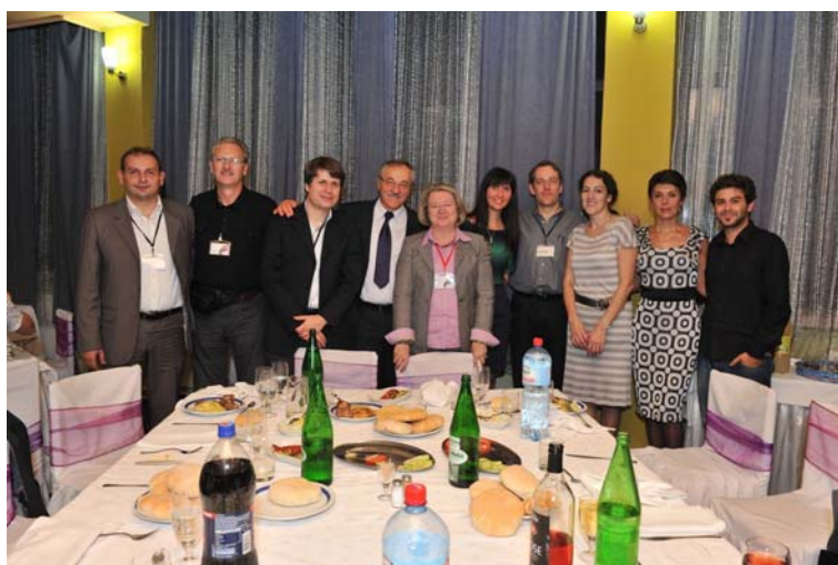
Some members of the Conference Organizing Committee with TELSIS 2011 participants