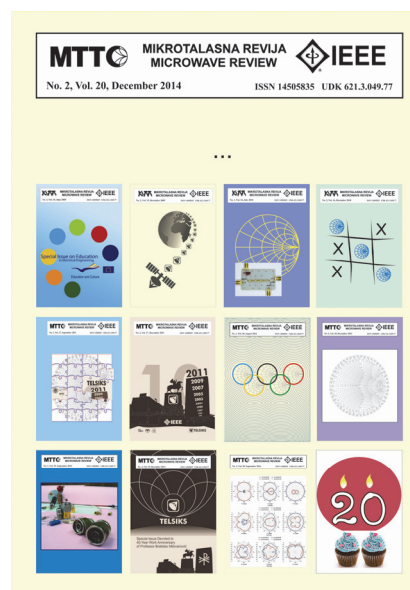
Microwave Review Vol. 20, No. 2